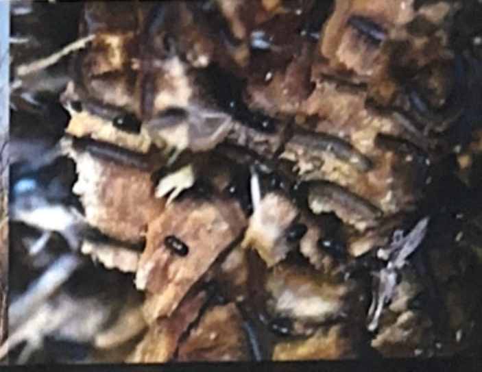
ISHB galleries in castor bean wood.

Two exotic, invasive beetles are causing increasingly extensive damage to Southern California's urban trees, native and riparian forests, and avocado groves. Thousands of severely affected trees have died or been removed in both natural and landscaped areas.