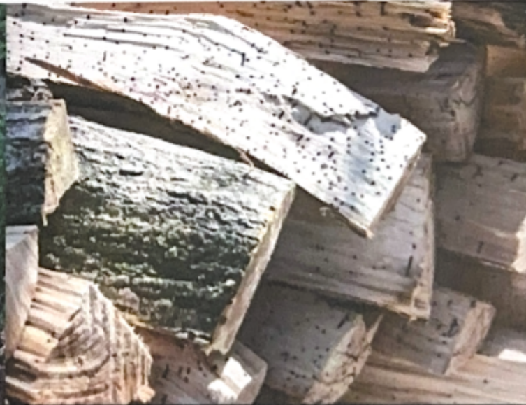
Box elder logs full of ISHB tunnels and beetles.