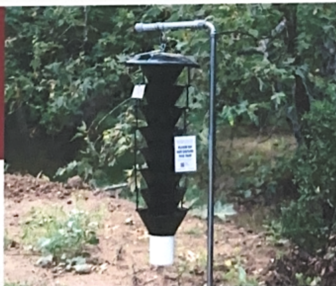
Monitoring trap used to detect ISHB.

1 UC Cooperative Extension, 2 UC Davis