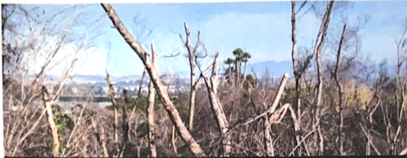
Willows in a San Diego creek devastated by ISHB.