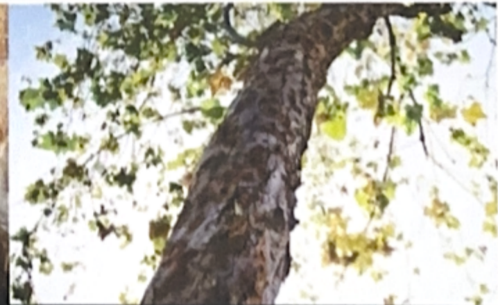
ISHB attacks on Mexican sycamore.